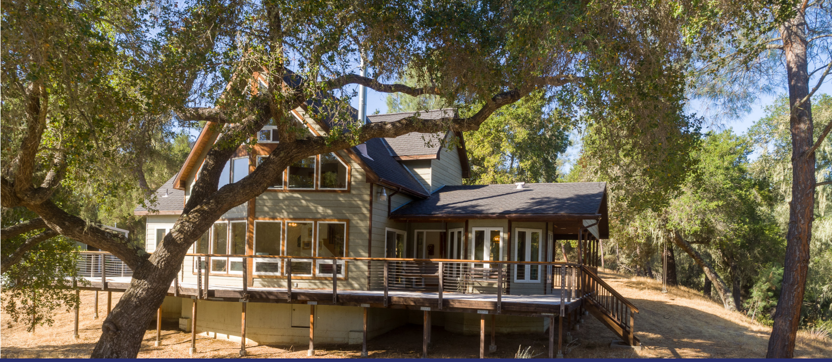
3170 Heron Lane, Paso Robles - Offered at $1,295,000